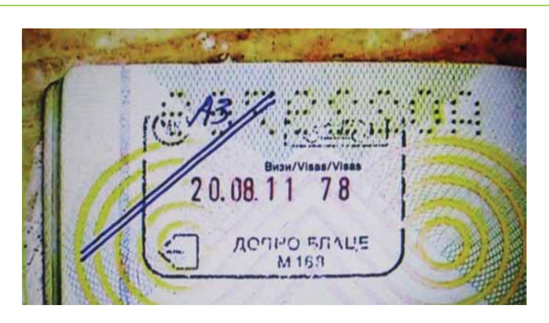
Not allowed to leave

Reports provide an indication of the highly arbitrary character of these controls and the exit bans they entail.