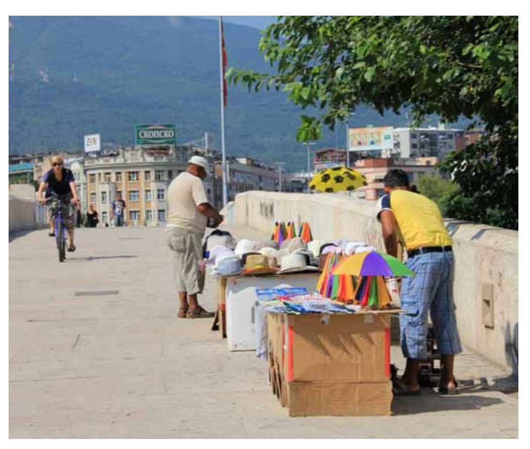
Street vendors in Skopje, July 2011.