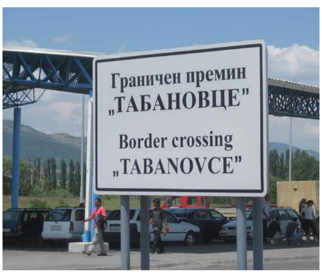
Bottleneck: border crossing between Macedonia and Serbia, July 2011.