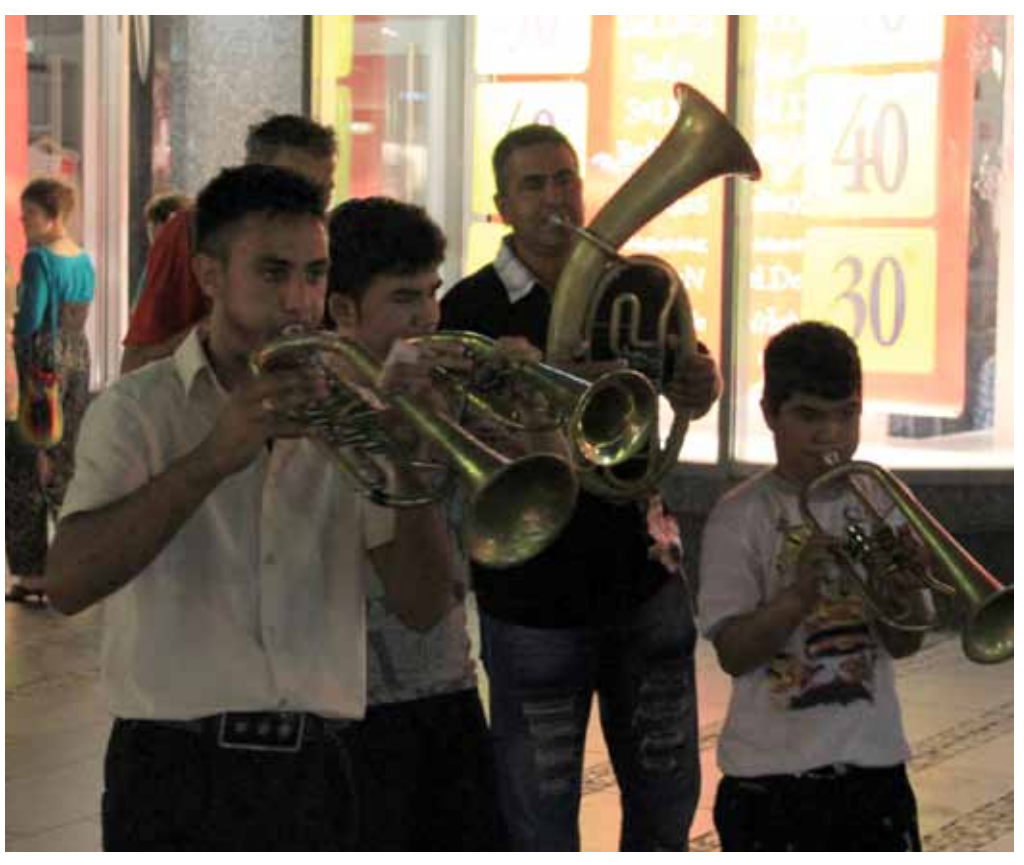
Musicians in Belgrade, July 2011.